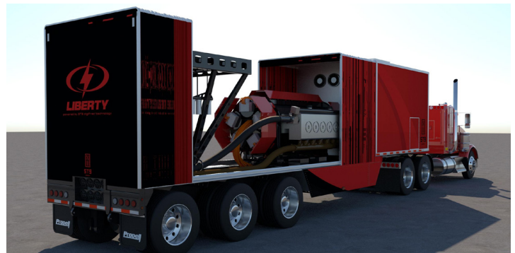
FULLY-INTEGRATED RIG WITH RETRACTABLE HOUSING

XGEN Septuplex fluid end provides +40% more fluid area to harness max power