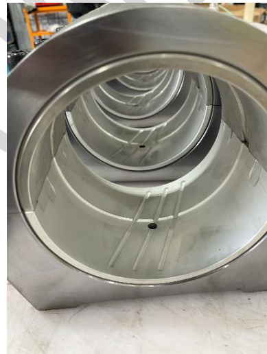
Pic 2 Journal Bearings in Knuckle