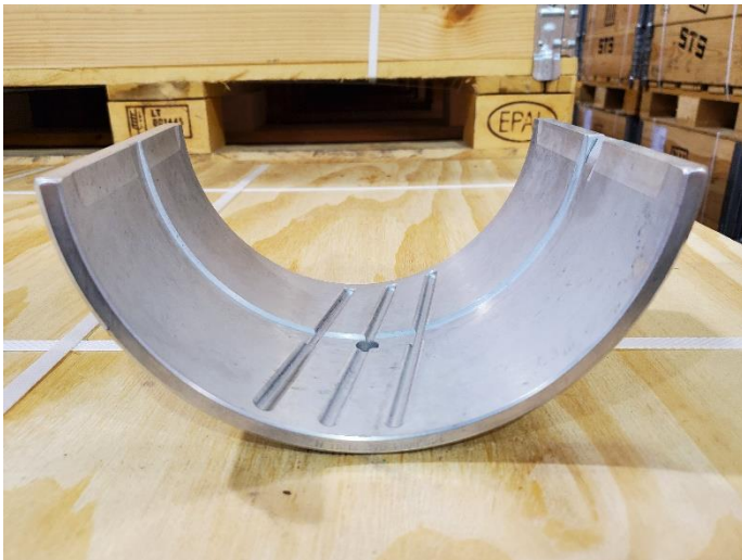
Pic 1 Journal Bearing With Grooves

The bearings are installed together in the knuckle for QC then broken apart and installed on the crankshaft.