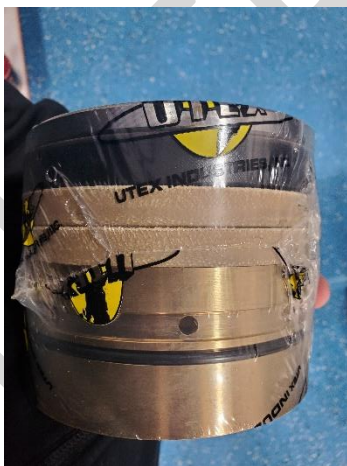
Pic 1 UTEX Packing Set with o-ring

Besides these changes, the fluid ends are the same. All stickers and markings denoting seat size, BOM, packing information will remain. See pic 3 & 4 for comparison.