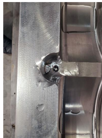
Pic 2 Modified grease port