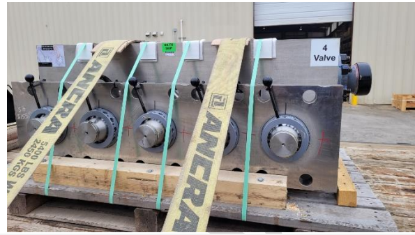
Pic 4 SLB FE backside