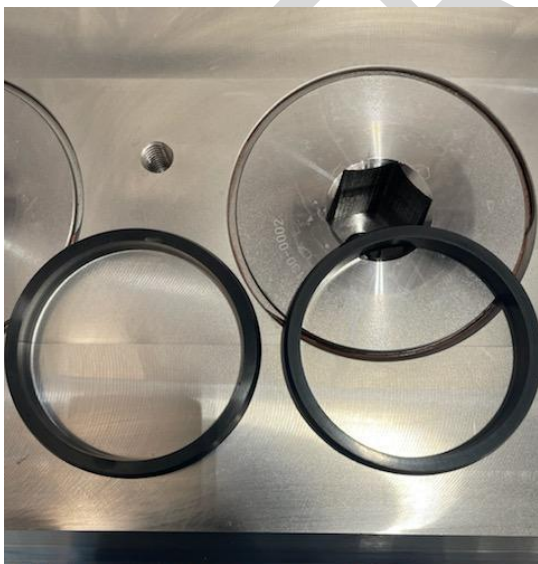
Pic 1 New D-Ring on Left