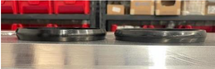
Pic 3 Urethane D-Ring Thicker