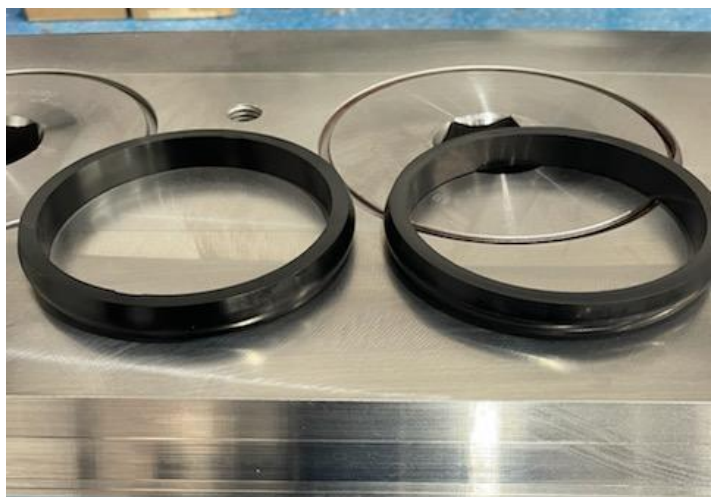
Pic 2 New D-Ring on Left